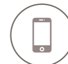
Using a mobile