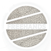
Provox Life™ FreeHands HME